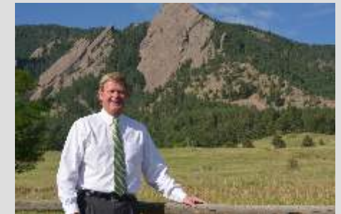
YOUR GUNBARREL REAL ESTATE SPECIALIST