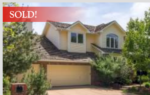
7045 Rustic Trail