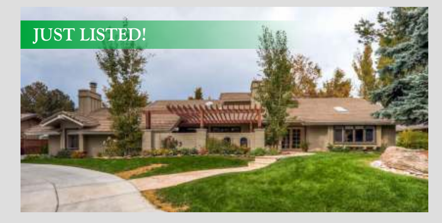
7143 Old Post Road | Offered at $879,700 4 Bedrooms | 4 Baths | 5,112 Square Feet