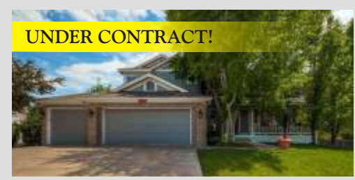
7300 Island Green Drive Offered at $888,000