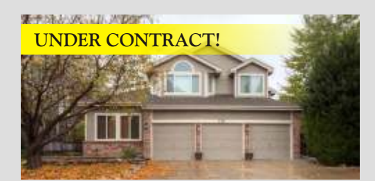
7341 Poston Way Offered at $613,700