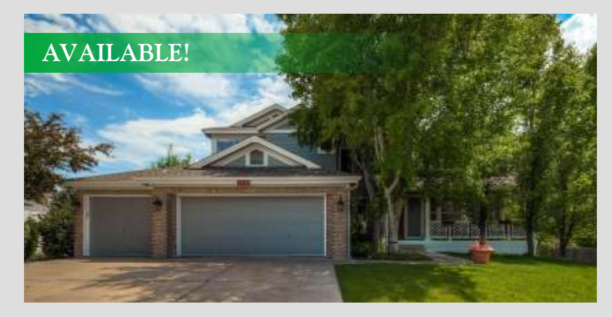
7300 Island Green Drive | Offered at $888,000 6 Bedrooms | 5 Baths | 4,789 Square Feet Great Two-Story Across From The Park