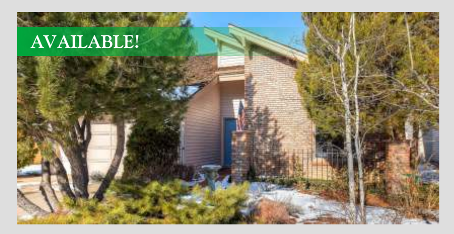
7181 Cedarwood Circle | Offered at $549,700 2 Bedrooms | 2 Baths | 1,958 Square Feet Patio Home Backing to a Pond